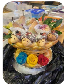
Taisia Florea, 8ID