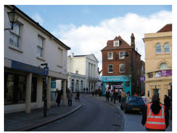
The centre of Bishop's Stortford which our pupils studied in detail.

analysing the large amounts of data they have gathered, writing up their results and developing a controlled assessment portfolio of 2000 words.