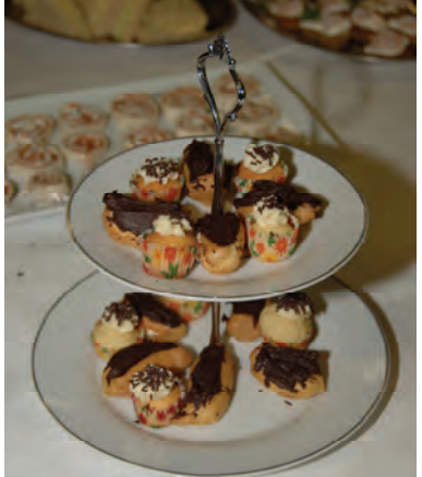
Delicious Buffet laid on by Year 10