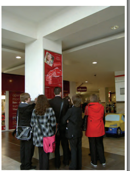
Stewards School pupils hard at work.

To help prove or disprove their hypothesis, our pupils conducted a geographical enquiry by interviewing local people and asking them for their opinions. conducted car park and pedestrian surveys, conducted attitudinal surveys, map surveys and took photographs of the town centre in Bishop's Stortford. Our pupils will now spend time