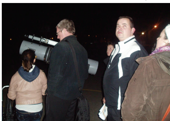
The community queuing to view Jupiter through the telescope.

lasts for several months and then fades away as it reaches the equator. Neptune takes 165 years to orbit the Sun.