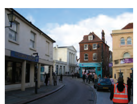
The centre of Bishop's Stortford which our pupils studied in detail.