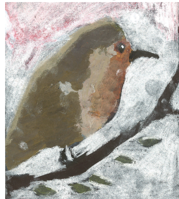
Fatimah Oseni 9RA