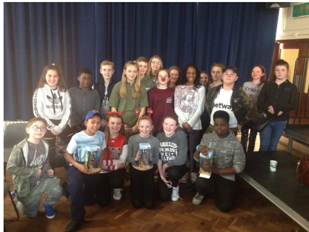
Year 7 pupils who took part in the year 7 Red Nose Day talent competition.