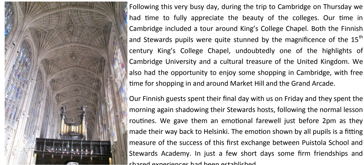
A cultural treasure inside King's College Chapel

had time to fully appreciate the beauty of the colleges. Our time in Cambridge included a tour around King's College Chapel. Both the Finnish and Stewards pupils were quite stunned by the magnificence of the 15<sup>th</sup> century King's College Chapel, undoubtedly one of the highlights of Cambridge University and a cultural treasure of the United Kingdom. We also had the opportunity to enjoy some shopping in Cambridge, with free time for shopping in and around Market Hill and the Grand Arcade.