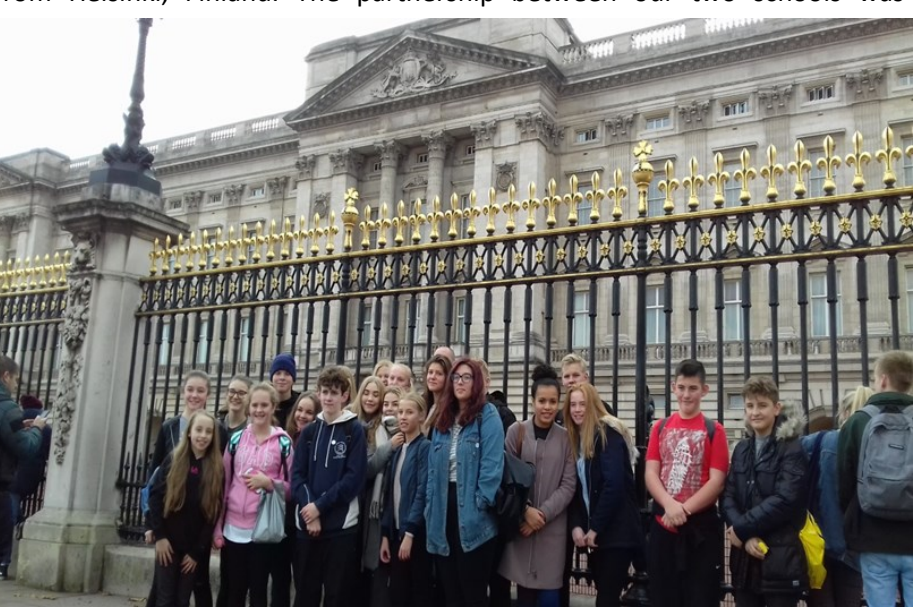
Outside Buckingham Palace and enjoying the experience!

established during 2014 and we have worked together to promote internationalism and cultural understanding between the schools. We were delighted to host 10 Finnish pupils and 3 teachers as part of this educational and cultural exchange. The Finnish children were hosted by 10 Stewards children in Years 9 and 8. All the children involved took part in a wide range of activities both within Stewards Academy and during two trips to London and Cambridge.