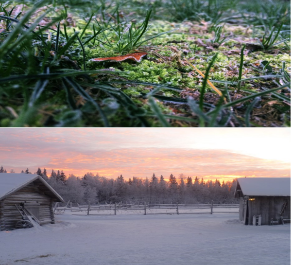
Upper and Lower School winners of the annual Christmas Card competition