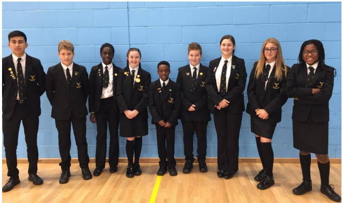
Year 7 Award Winners