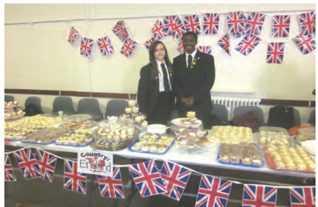
THE STEWARDS ACADEMY CULTURAL FOOD EVENT 2012