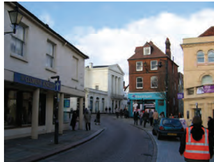
The centre of Bishop's Stortford which our pupils studied in detail.