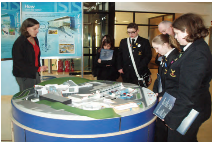
A model of ISIS with Stewards students looking on.