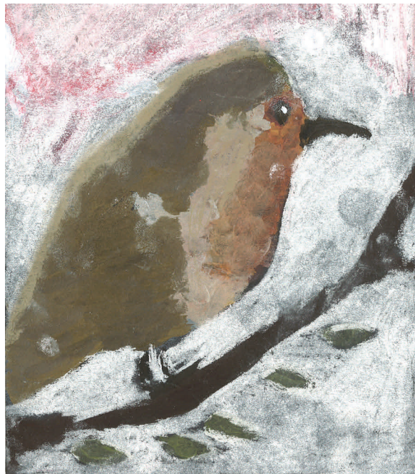
Fatimah Oseni 9RA