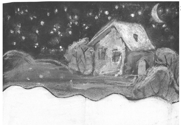
Awwal Kazeem 9RA