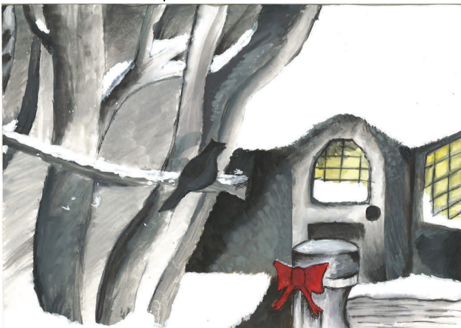
Alarna Mace 9VM